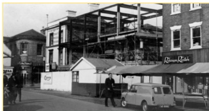
Above: re-building the Moot Hall, 1965

So, does this make the building we see today an 18th century original or a modern replica?