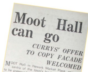
Right: The Newark Advertiser 16th October, 1965